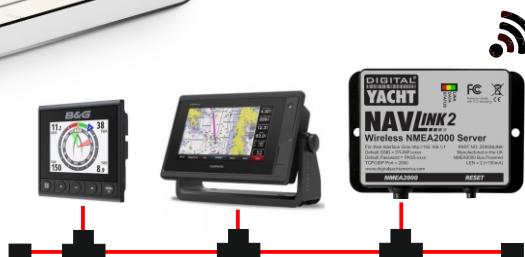
NMEA 2000 BACKBONE

Open up your boat to the world of apps and tablet navigation